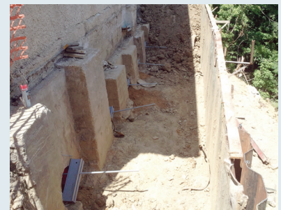
Tiebacks advanced through core holes of concrete underpinning