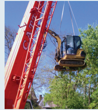
Lowering mini-excavator onto working surface below wall

Products Installed: (24) Foundation Supportworks® Model 150 Helical Tiebacks, 12"-14" Helix Plate Configuration, Installed to Lengths of 12 to 35 feet, Design Working Load of 21 kips