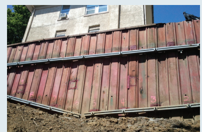
Tieback and waler installation complete